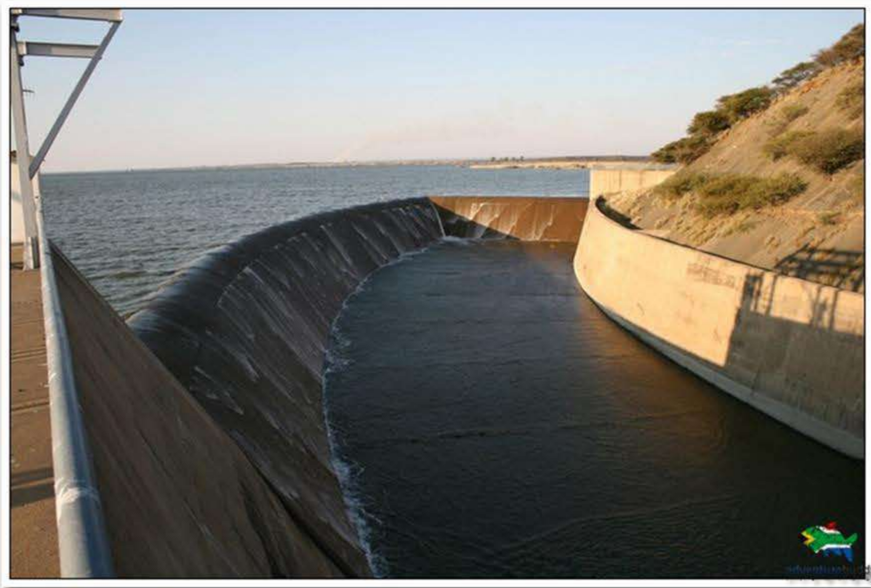
Spitskop Dam.

The total surface area of all the dams in the Northern Cape is approximately 21,257 ha (213 km 2 or 14 x 14 km).