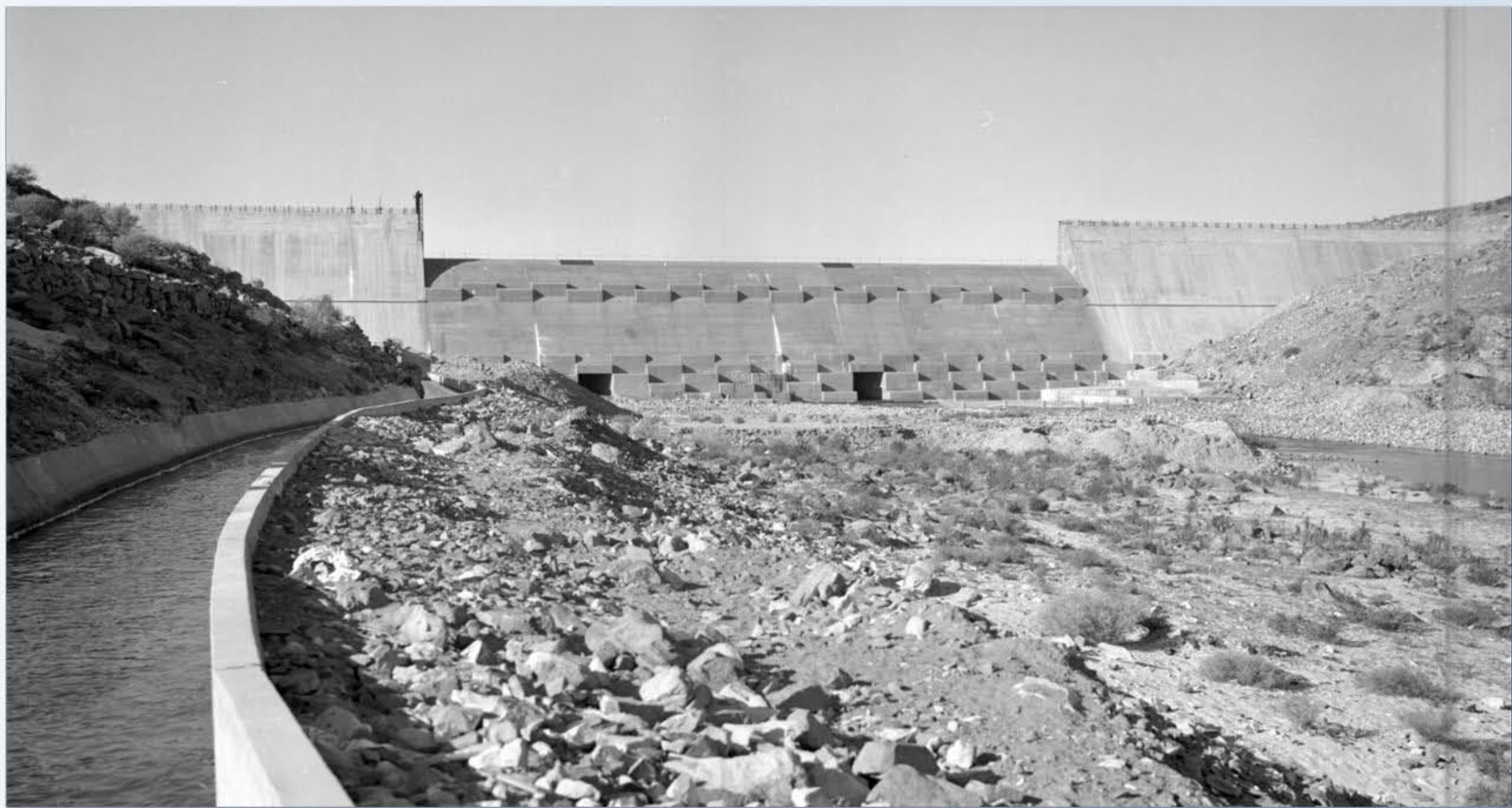
After construction: 1935