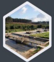
Civil Engineering Services