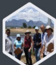
Training and Mentoring